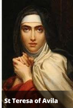
St Teresa of Avila