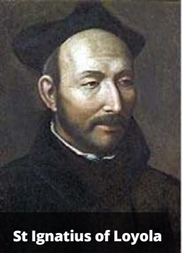
St Ignatius of Loyola